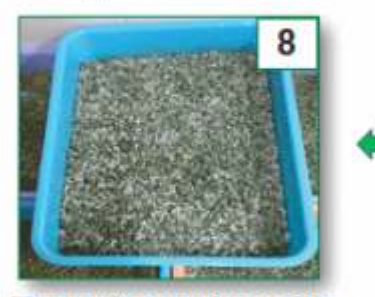
Transfer grains with Trichodermain trays for drying