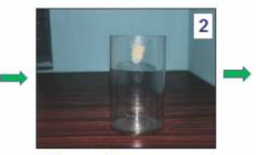
Place a honey cotton swab