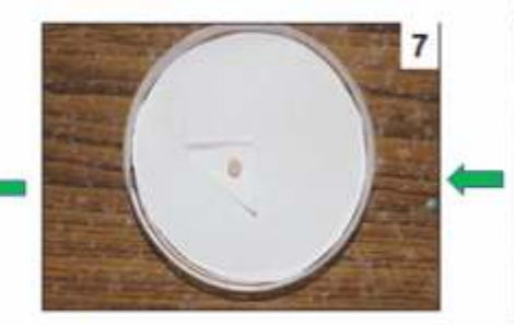
Collect the egg mass in a Petri dish