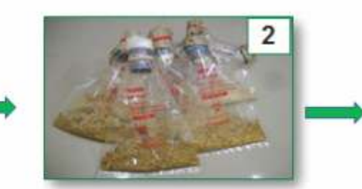
Fix a 1.5" PVC pipe at the top equal amount of tap water of the bag with rubber band