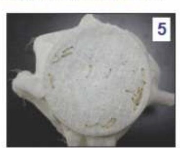
Add 10-15 Corcyra larvae on muslin cloth