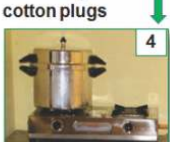
Put bags in a pressure cooker (upright position) & cook for 40 min.