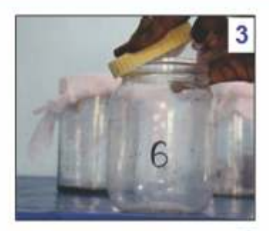
Add 30-50 adults