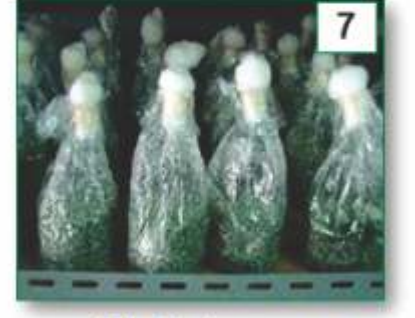
Shake bags every alternate day