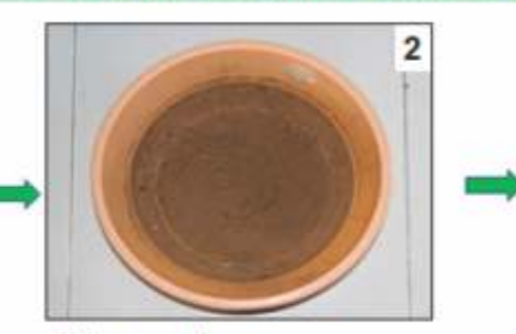
Place a honey cotton swab